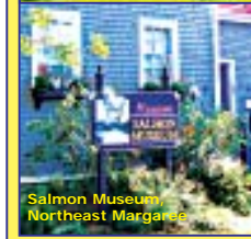
Salmon Museum, Northeast Margaree