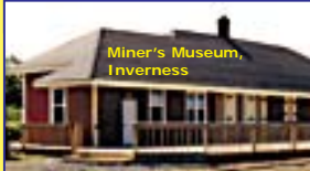
Miner's Museum, Inverness