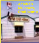
Acadian Museum, Chéticamp