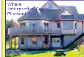
Whale Interpretive Centre Pleasant Bay