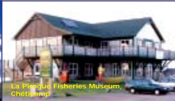
La Pirogue Fisheries Museum, Chéticamp