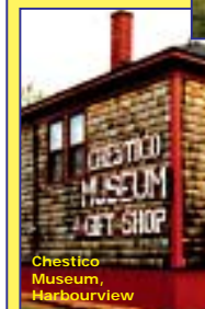
Chestico Museum, HarbourView