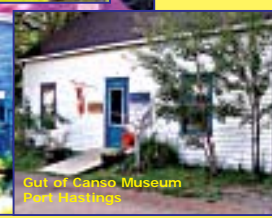
Gut of Canso Museum Port Hastings