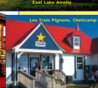
Les Trois Pignons, Chéticamp