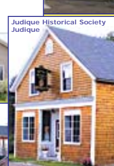
Judique Historical Society Centre Judique