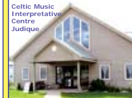
Celtic Music Interpretive Centre Judique