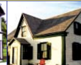
MacDonald House Museum, East Lake Ainslie